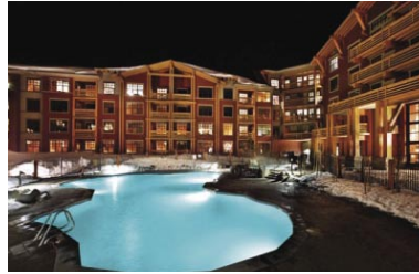
"Resort Hotel – LEED Certified"