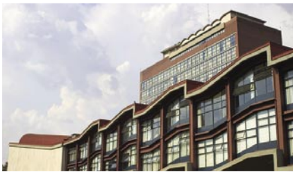
"Student Housing – LEED Silver"