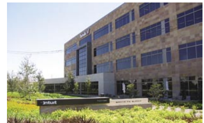
"Office Complex – LEED Silver"